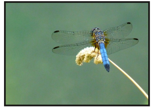
2nd Place: Dragonfly by Ava Leigh