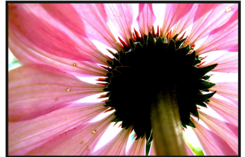
3rd Place: Purple Coneflower by Maggie Rubin